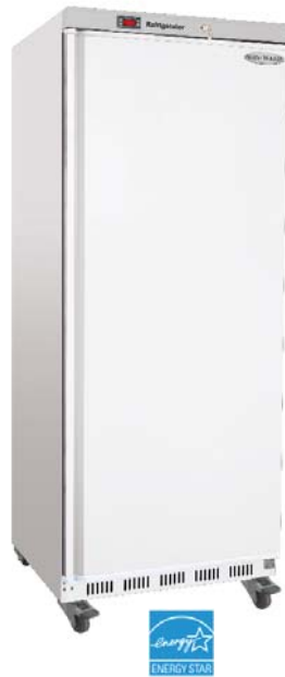
ER-25 Single Door Refrigerator