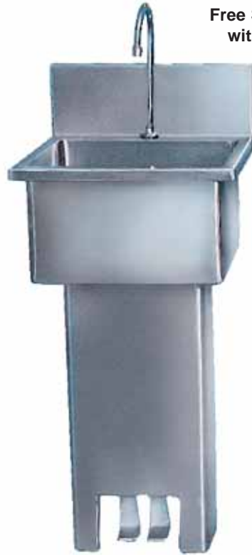
Free Standing Sink with Foot Pedals WHPS1616