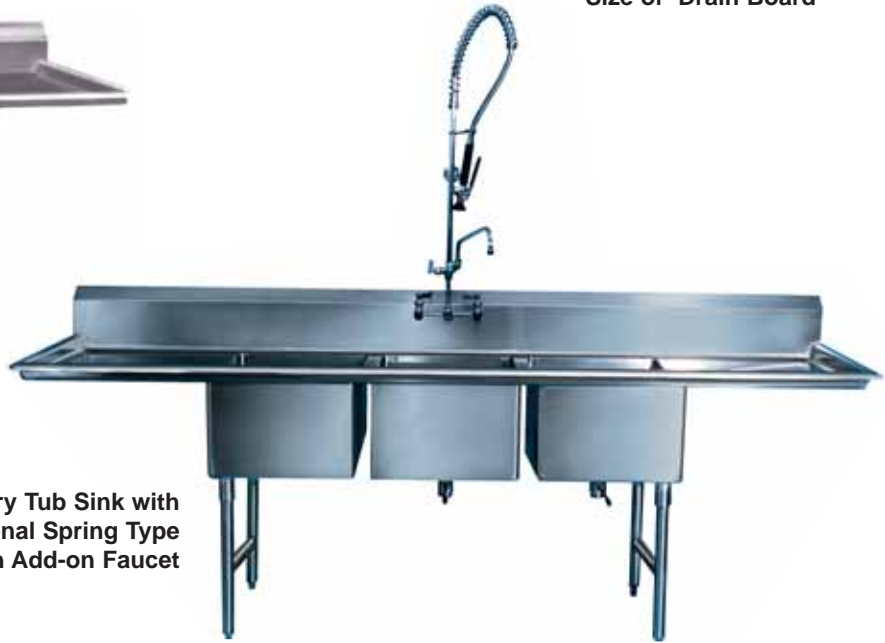
Triple Bakery Tub Sink with Optional Spring Type Pre-Rinse with Add-on Faucet