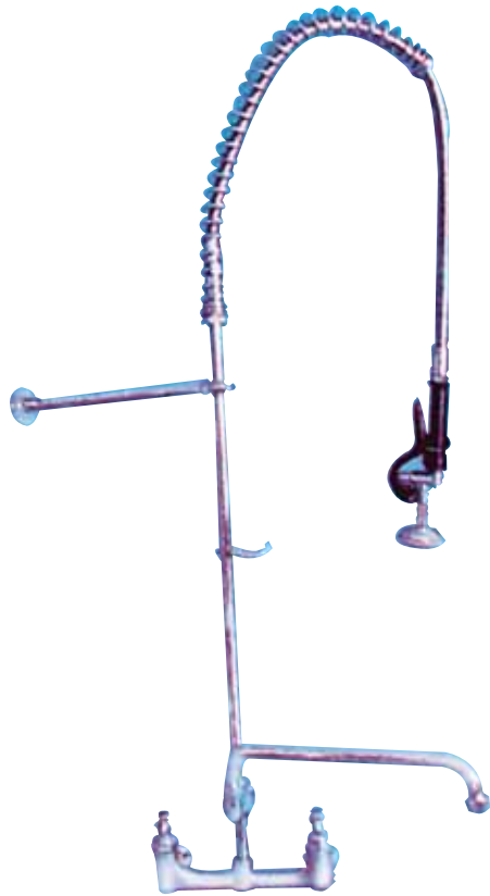
Spring Type Pre-Rinse Unit with Wall Bracket (WS-SPR-ST) and optional 14\"/>

All Win-Holt sink accessories are chrome plated brass, and they are NSF approved.