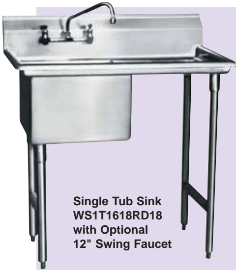
Single Tub Sink WS1T1618RD18 with Optional 12" Swing Faucet

For preparation and processing in all Food Service environments.