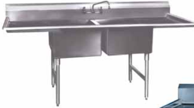
Double Tub Sink w/ 2 Drainboards

1L 18 Number, Location & Size of Drain Board