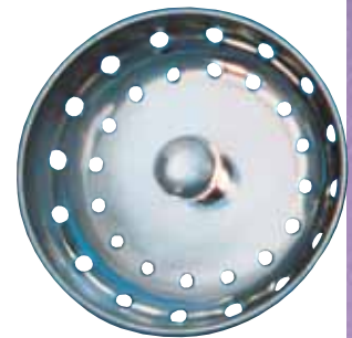
Basket Drains for all Sinks