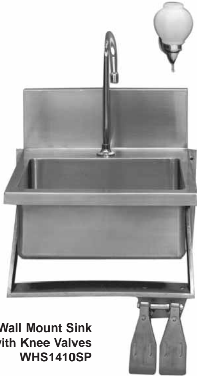
Wall Mount Sink with Knee Valves WHS1410SP